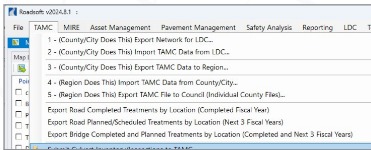
Sharing culvert data from Roadsoft is as easy as selecting Submit Culvert Inventory/Inspections to TAMC from the TAMC menu.

Under the TAMC menu, select Submit Culvert Inventory/Inspections to TAMC . A TAMC Culvert Submission window